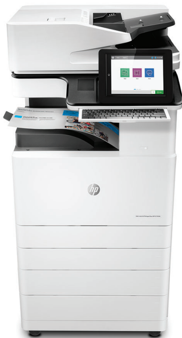
HP Color LaserJet Managed Flow MFP E77830z